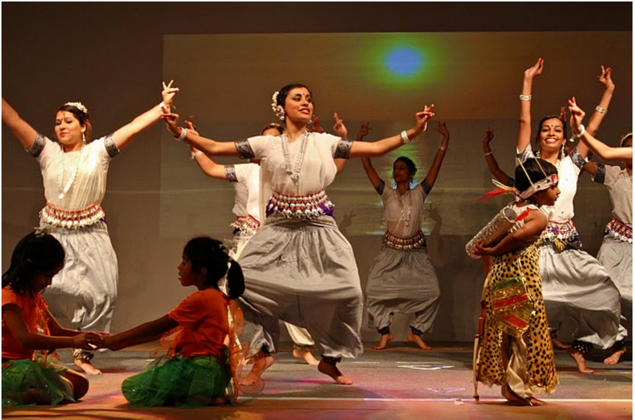
(OSA 11 inaugural cultural program - "our heritage our pride")