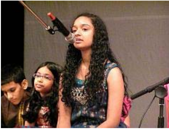
(Odia children singing Champu, Chhanda, Odissi songs)