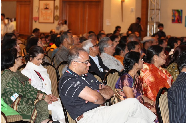
(42 nd OSA Convention Audience)